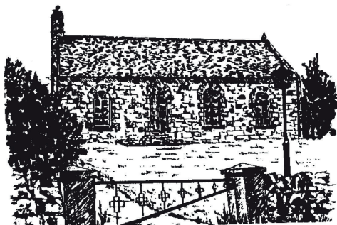
Cluny Church of Scotland SC003429